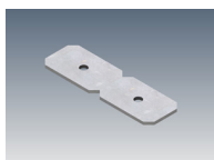
JN-ST Straight joiner