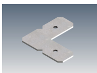
JN-90 90 degree joiner